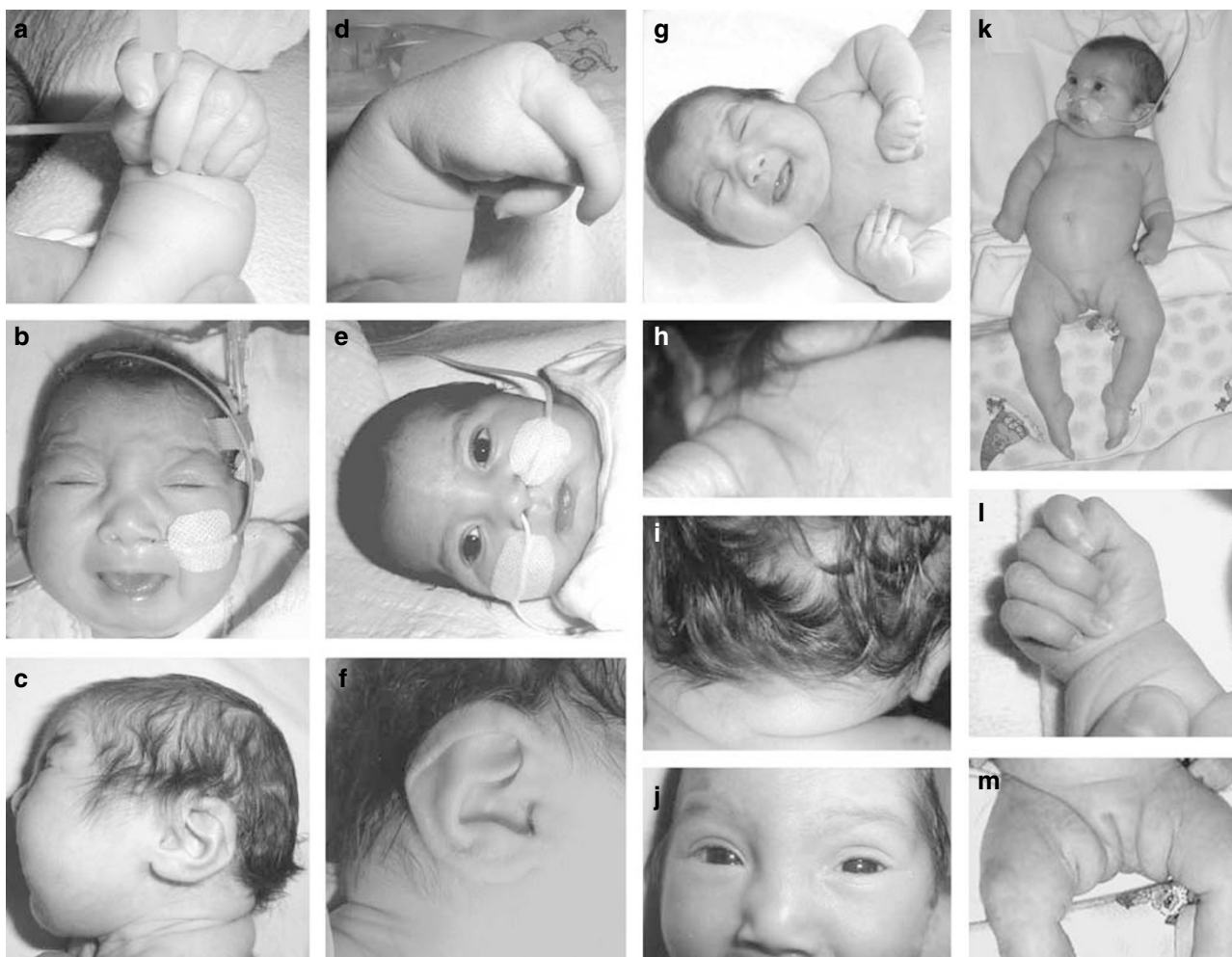
Figure 1 Clinical features of Patients 1 (a–d, h, j, m) and 2 (e–g, i, k, l). Note the profound microcephaly, flat forehead, low-set, dysplastic ears, short nose, retrognathia (b, c, e, f, g, j). (h, i) Wrinkled skin around the neck and the posterior axillary region. (a, d and g) adducted thumb and peripheral contractures of the DIP and PIP joint with overlapping fingers. (c) Note adducted thumb at the age of 7 months. (k and m) Abnormal fat distribution in the patients around the thighs.

hypertension and urosepsis owing to obstructive uropathy. Blood CK levels (normal value <200 U/l) varied between 180 and 360 U/l and up to 4000 U/l in fever episodes. He received tube feeding for gastrointestinal pseudoobstruction. He also had a severe multisystem disorder, comparable with that of his older sister, including microcephaly, dysmorphic features, hypotonia with peripheral joint contractures. Brain ultrasound and MRI showed brain atrophy with cerebellar atrophy and corpus callosum hypoplasia. Kidney ultrasound showed hydronephrosis on the left. Ophthalmologic examination was normal. Echocardiography detected a peri-membranous VSD with ASD II (Table 1).