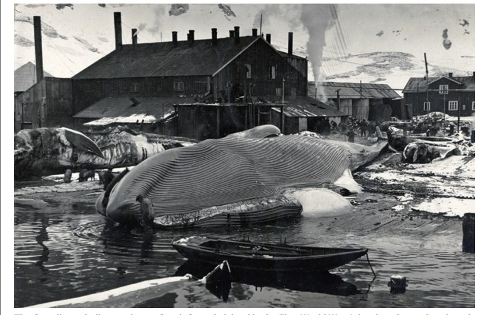
The Grytviken whaling station on South Georgia island in the First World War. It has long been abandoned.