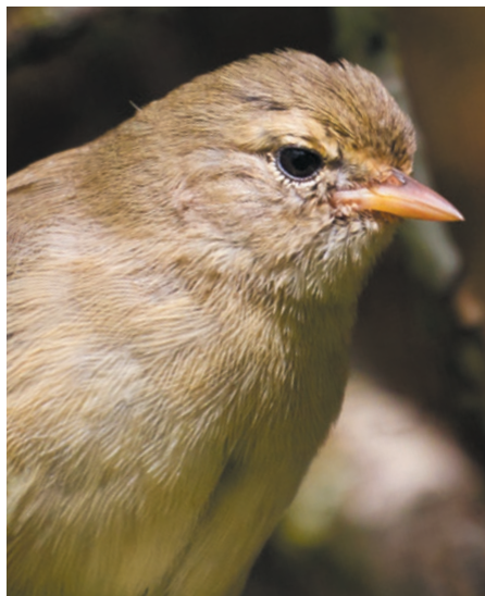
Ground finches (left) tend to have large beaks for cracking seeds, whereas warbler finches spear insects.