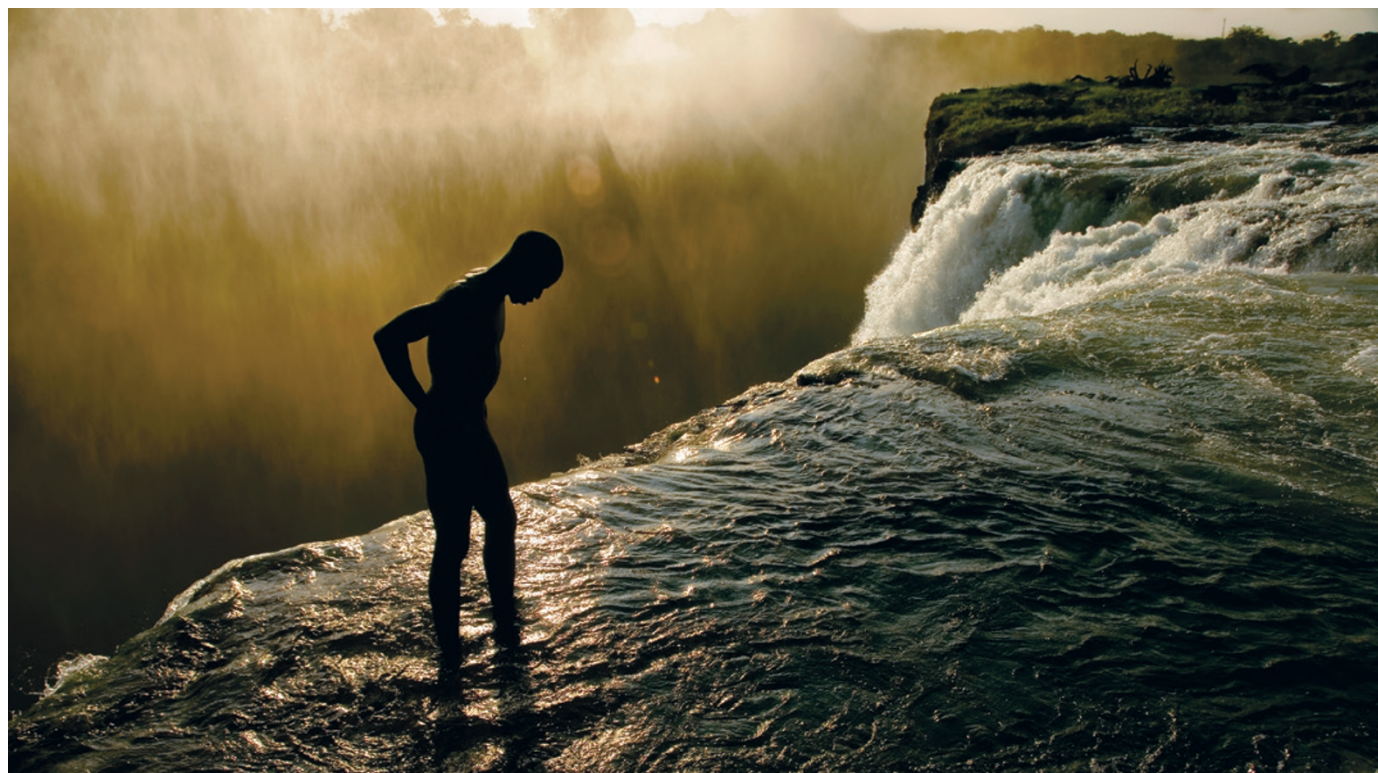
Areas surrounding Victoria Falls, on the Zambia–Zimbabwe border, are protected by national-park status.

avoiding the loss of species and maintaining the integrity of ecosystems. There are methods for estimating the losses that protection has prevented (to provide lessons) or could prevent (to set priorities). By these metrics, protected areas can be disappointing.