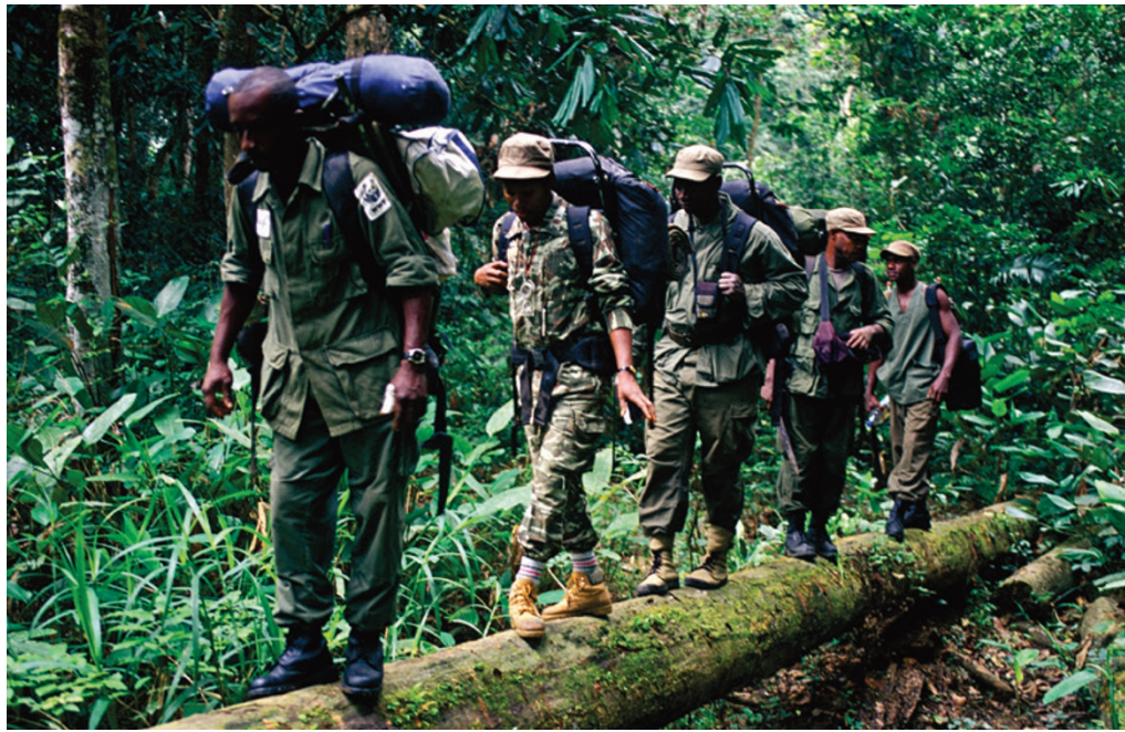
An anti-poaching team of the conservation group WWF on patrol in Minkébé National Park, Gabon.

To help refocus priorities, our group created software called Marxan. It uses mathematical optimization to prioritize places to design efficient and representative protected areas. We have also developed a