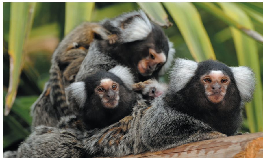
Marmosets share behaviours, such as making eye contact as a means of communication, with humans.

Central to the Brain/MINDS effort is the creation of transgenic marmosets to elucidate cognitive function and as models of human brain disease. Although more distantly related to humans than primates such as chimpanzees, these monkeys are in many ways ideal for brain research. Their small size and fecundity make them easier and more efficient to work with