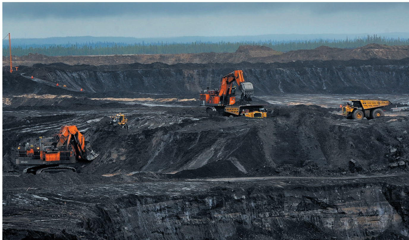
Oil extracted from fields in Alberta, Canada, would travel through the proposed Keystone XL pipeline.