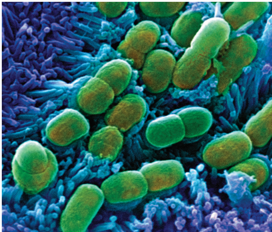
Starved Escherichia coli bacteria (green) challenged with synthetic molecules could lead to new antibiotics.

effectiveness of existing antibiotics. To explore the creation of treatments based on these peptides, Hancock started a company, now called Soligenix, based in Princeton, New Jersey. One of these agents is now in phase 2 clinical trials.