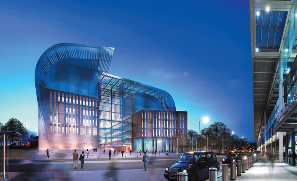
The interdisciplinary Francis Crick Institute will open in central London in 2015.