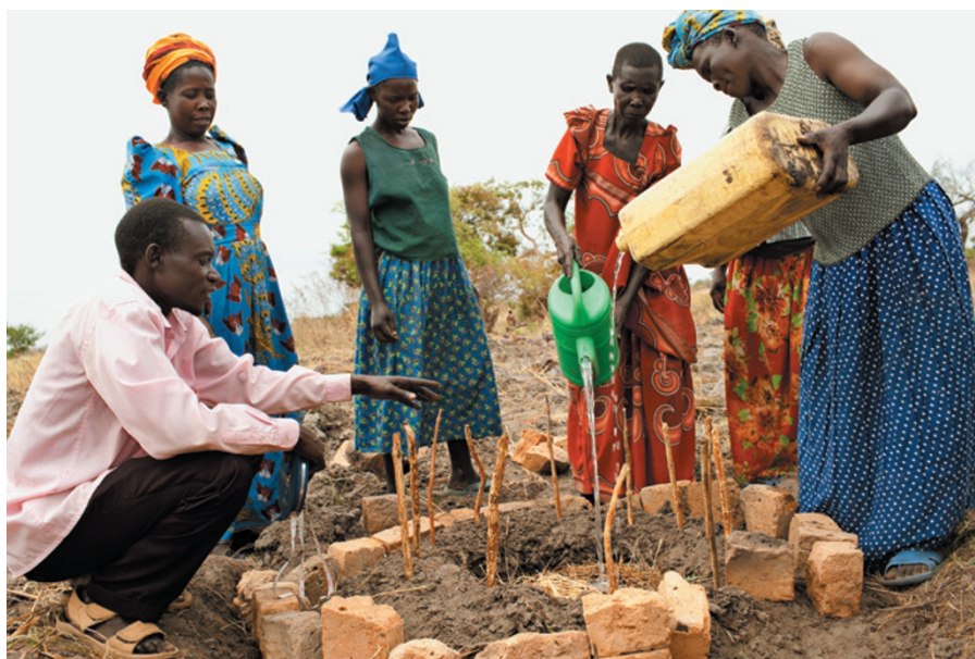
Participants in a farmer field school in Uganda learn about manure.

Field labs attract innovative farmers — early adopters who can spread best practices. The challenge now is to evaluate and popularize the approach. In Europe, at least, the