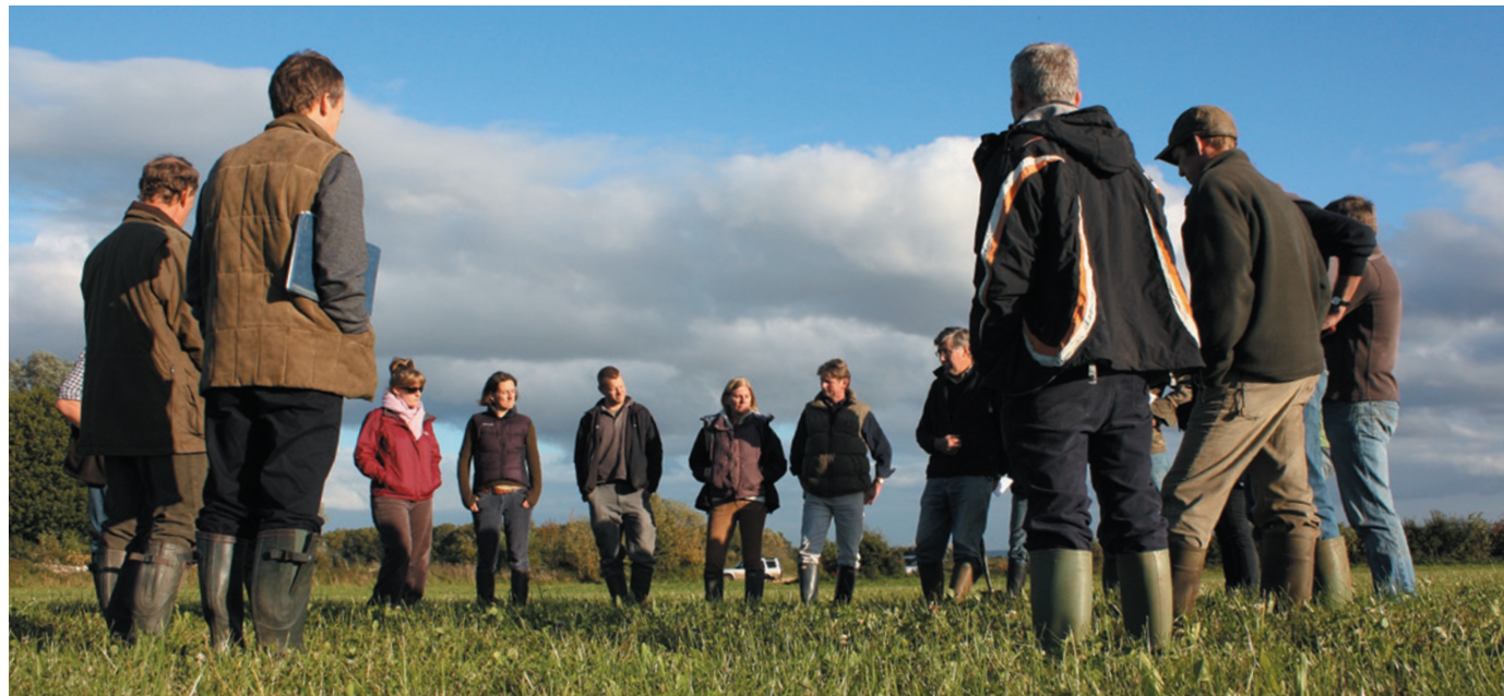
UK farmers in the Duchy Originals Future Farming Programme.