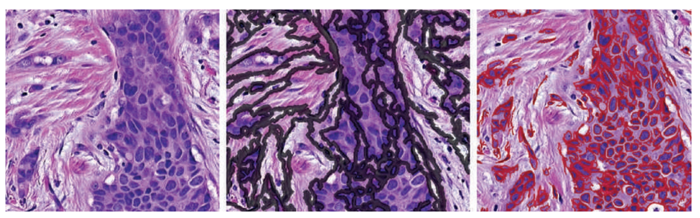
Breast cancer image at X200 magnification (left) is broken down into superpixels (black) by an algorithm before it predicts the patient's prognosis.

says Yuan. When astronomers got access to powerful telescopes and digital images, they didn't insist on counting every star — they let computers take over such tedious tasks. It should be the same with digital microscopes and cells, she says.