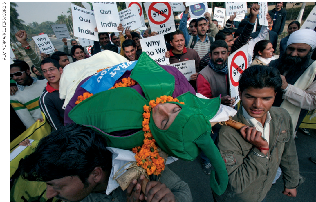
Students demonstrating against the use of GM aubergine (brinjal) in the northern Indian city of Chandigarh in 2010.

CONSERVATION The stories we tell about endangered species p.39