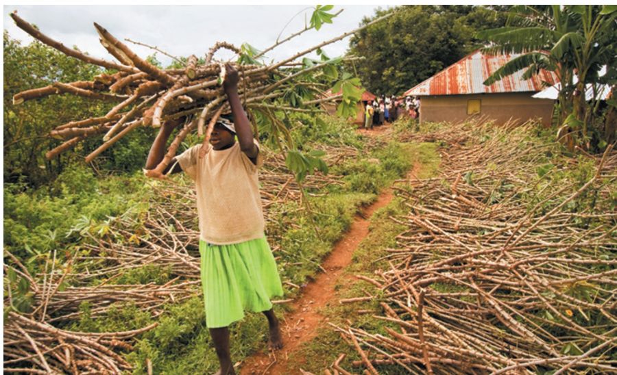
In Kenya, the staple crop cassava is being genetically engineered to resist two viral diseases.

Much of the European opposition to GM crops, although couched solely as worries about safety, also stems from concerns about the effect of large-scale farming on small-scale farmers, and the potential for biotech companies to create monopolies. In fact, people often equate all biotechnology with genetic engineering — putting the wide range of advanced non-GM techniques used to improve crops, such as tissue culture and marker-assisted breeding, into the 'unacceptable' category. These techniques can greatly assist conventional breeding efforts 6 .