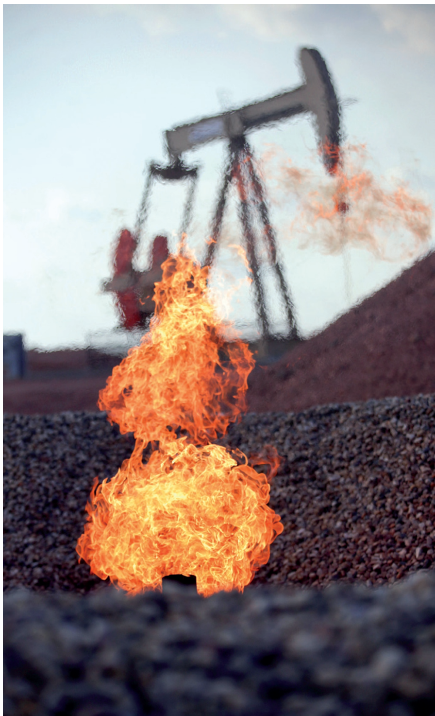
Gas being burnt off at the Bakken shale oil field in North Dakota as a by-product of oil extraction.