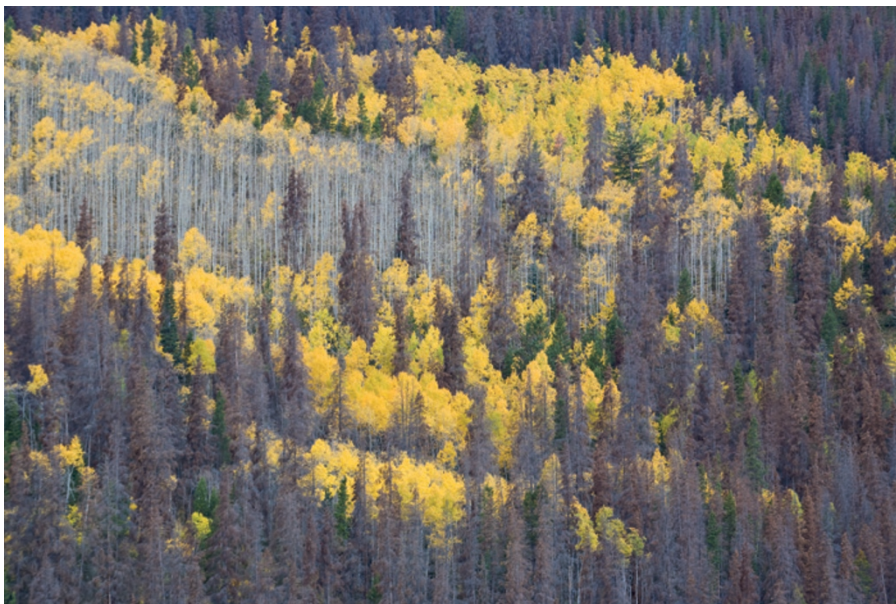
Forests in Colorado are being pushed towards collapse by pine-beetle infestations.

▶ of the dust and atmospheric gas in ice cores) and the onset of epilepsy (signalled by a sudden change in the electrical activity of the brain).