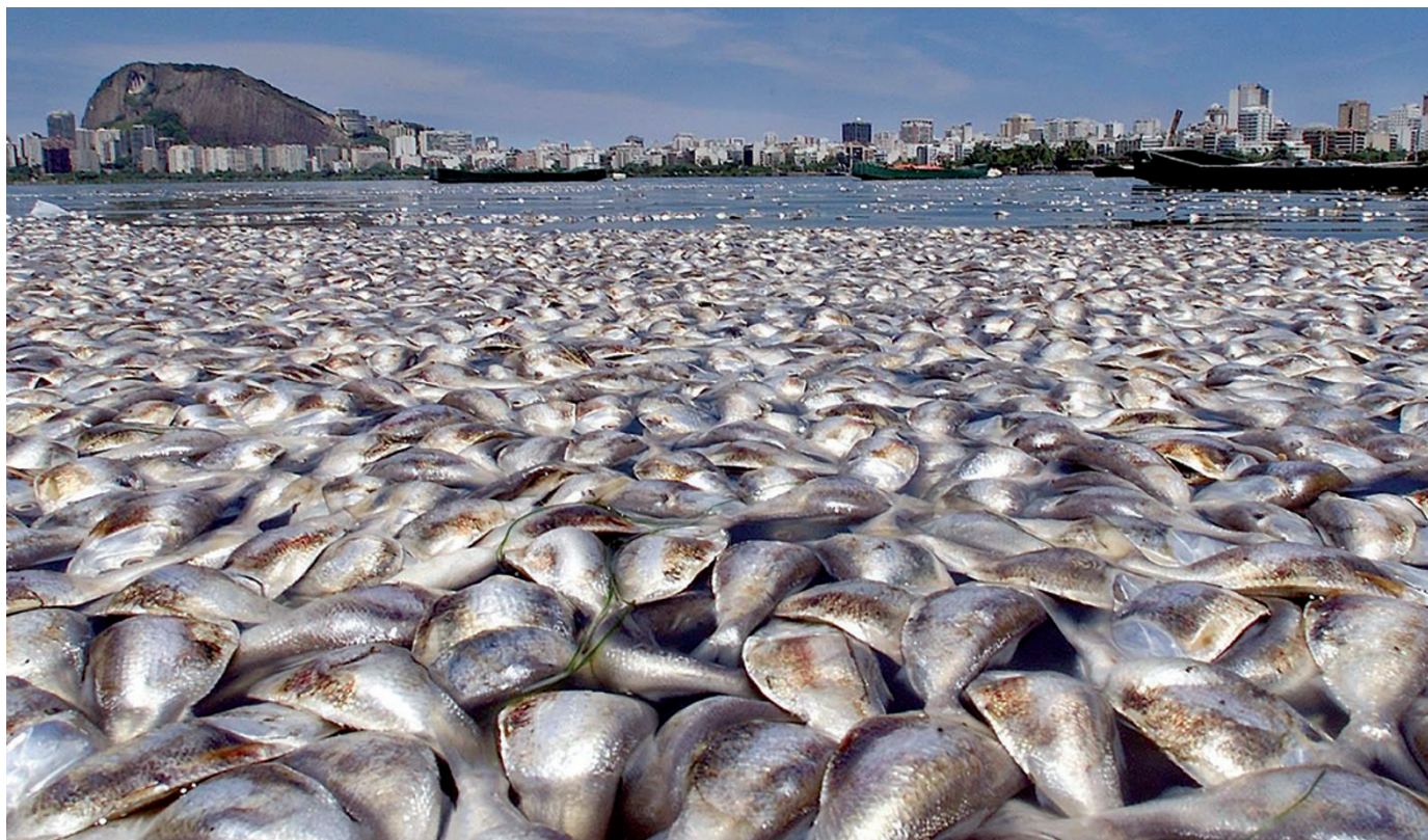
The shores of Rodrigo de Freitas Lake in Brazil are littered with fish killed by algal overgrowth in March 2000.