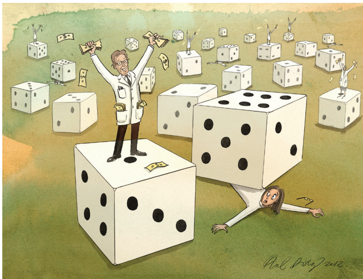
ILLUSTRATION BY PHIL DISLEY