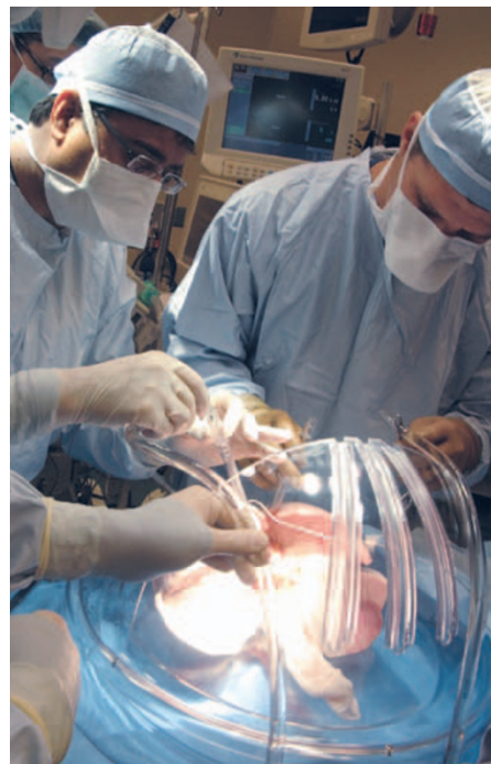
Surgeons strip lungs of their original cells.