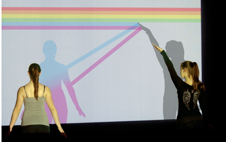
Social Light at the Science Museum in London lets audience members act as mirrors.