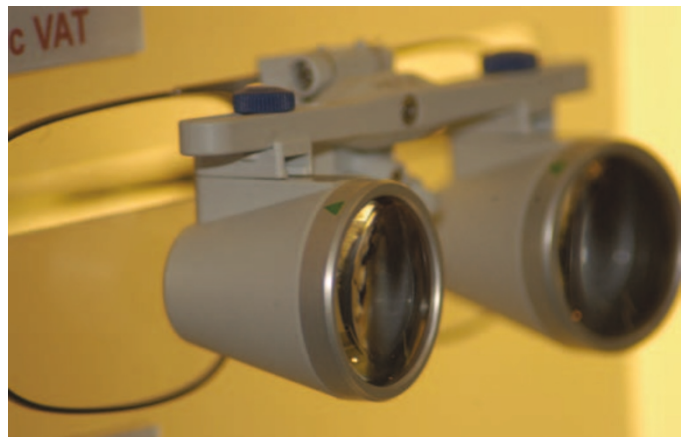
Someone had their eyes on some new kit!