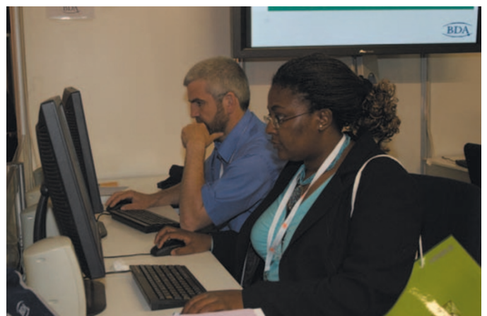
Surfing central Birmingham style