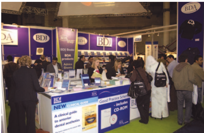
Busy times on the BDA stand, where new members joined and much merchandise was sold