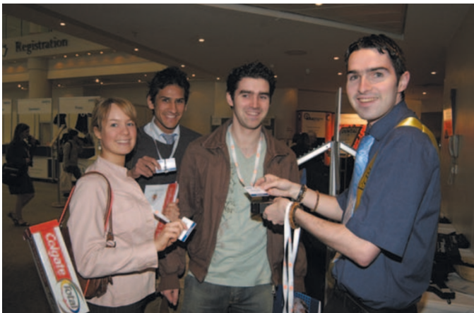
Happy delegates queue up to enter