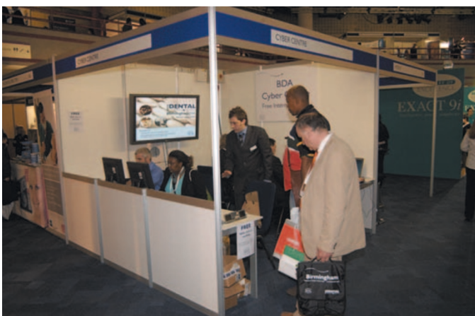
The BDA's free internet zone proved very popular throughout the conference