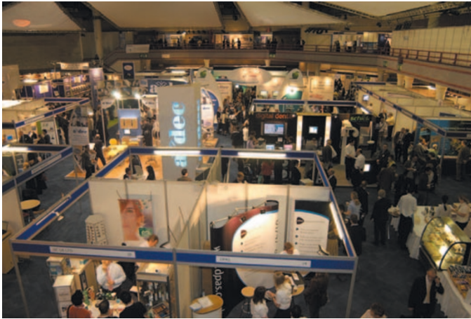
The exhibition area was large, sold out and well attended