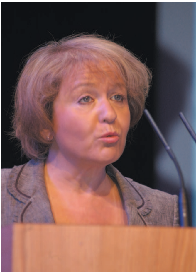
Dentistry Minister Rosie Winterton was left in no doubt about dentists' grave concerns over the new NHS contract (left)