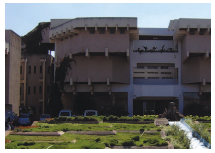
SDM Dental College, Dharwad, India, showing ventilated concrete construction for cooling in the heat of summer.

A smooth and comfortable flight from Heathrow to Bangalore touched down on time to the minute. This route to India's 'Silicon Valley' had only started in October and takes about eight and a half hours direct. Not so comfortable, nor so prompt was the one and a half hour local flight from Bangalore to Hubli, a regional hub, in the smallest plane most of us had ever travelled in, passing operational DC-3s of the Indian Air Force! Our destination was the leafy university town of Dharwad, adjacent to Hubli