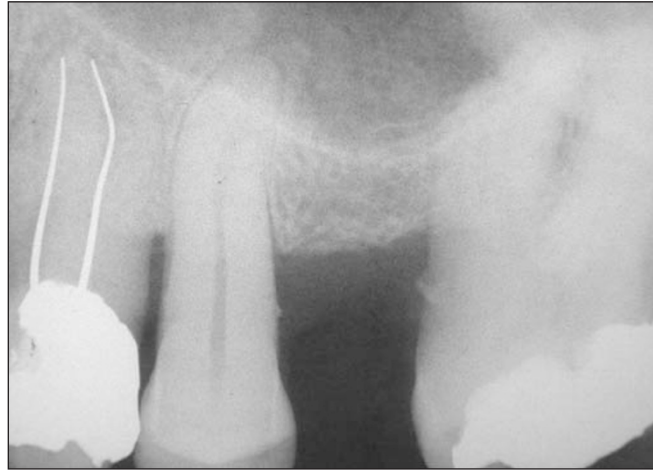
Fig. 14 Tooth UL4 (24) has previously been root treated (and obturated with silver points) but is symptomless. However, the tooth now requires a full crown restoration. A decision must be made as to whether the tooth should be re-treated before fitting the advanced restoration.