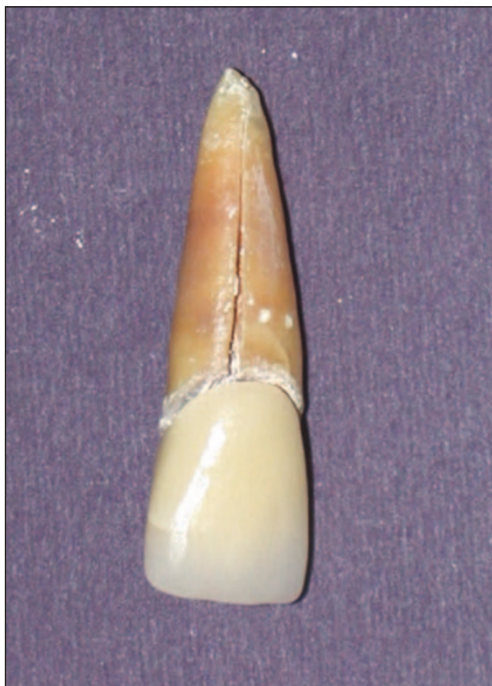
Fig. 12 The vertical root fracture can be clearly seen in this extracted tooth which had been fitted with a post crown.

Both types of resorption may eventually lead to