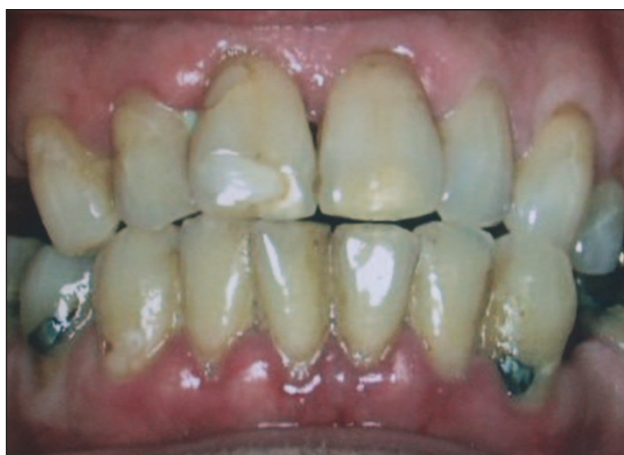
Fig. 2 An assessment should be made of the patient's general dental condition.

It is usually possible to decide, as a result of questioning the patient, whether the pain is of pulpal, periapical or periodontal origin, or if it is non-dental in origin. As it is not possible to diagnose the histological state of the pulp from the clinical signs and symptoms, the terms acute and chronic pulpitis are not appropriate. In cases of pulpitis, the decision the operator must make is whether the pulpal inflammation is reversible, in which case it may be treated conservatively, or irreversible, in which case either the pulp or the tooth must be removed, depending upon the patient's wishes.