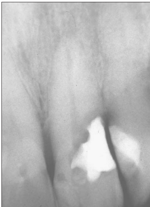
Fig. 11 Tooth UL1 (21) was so extensively decayed subgingivally that restoration would have proved impossible even if endodontic treatment had been carried out.

tis, for example one who has had a previous attack, may not be considered suitable for complex endodontic therapy.