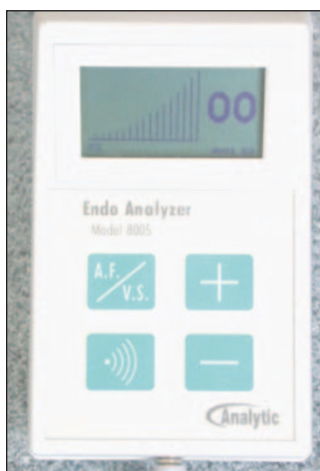
Fig. 6 A modern electric pulp tester combined with an endodontic apex locator.

In cases where the patient cannot locate the pain