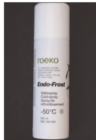
Fig. 7 A more effective source of cold stimulus for sensibility testing.

Root treatment should be considered for any tooth with doubtful vitality if it requires an extensive restoration, particularly if it is to be a bridge abutment. Such elective root canal treatment has a good prognosis as the root canals are easy to access and are not infected. If the indications are