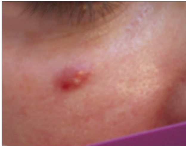
Fig. 1 A facial sinus associated with a severe periapical abscess on the upper canine.

specialist or general medical practitioner. Not all patients with cardiac lesions require antibiotic prophylaxis, and such regimes are not generally supported by the literature. 2 However, if it is agreed that the patient is at risk, they would normally be prescribed the appropriate prophylactic antibiotic regime, and should be advised to report even a minor febrile illness which occurs up to 2 months following root canal treatment. Prior to endodontic surgery, it is useful to prescribe aqueous chlorhexidine (2%) mouthwash.