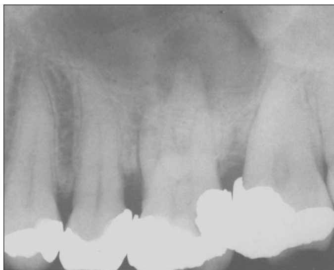
Fig. 4 A radiograph taken as part of a periodontal assessment also reveals a previously undiagnosed and asymptomatic periradicular lesion on the palatal root of tooth UL6 (26).

If a sinus is present and patent, a small-sized (about #40) gutta-percha point should be inserted and threaded, by rolling gently between the fingers, as far along the sinus tract as possible. If a radiograph is taken with the gutta-percha point in place, it will lead to an area of bone loss showing the cause of the problem (Fig. 5).