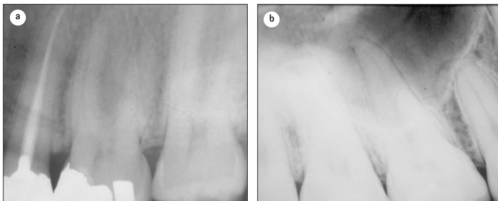
Fig. 3 The anatomical detail obtained from a radiograph taken by the long-cone paralleling technique (a) is far clearer and more accurate than when the bisecting angle technique (b) is used.

relatively crude and unreliable. No single test, however positive the result, is sufficient to make a firm diagnosis of reversible or irreversible pulpitis. There is a general rule that before drilling into a pulp chamber there should be two independent positive diagnostic tests. An example would be a tooth not responding to the electric pulp tester and tender to percussion.