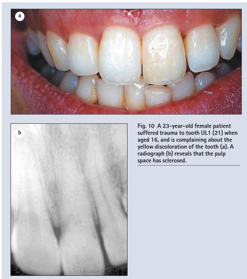
Fig. 10 A 23-year-old female patient suffered trauma to tooth UL1 (21) when aged 16, and is complaining about the yellow discoloration of the tooth (a). A radiograph (b) reveals that the pulp space has sclerosed.

The patient's physical or mental condition due to, for example, a chronic debilitating disease or old age, may preclude endodontic treatment. Similarly, the patient at high risk to infective endocardi-