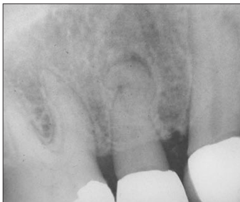
Fig. 13 The tooth UR4 (14) has such a bizarre root canal anatomy that endodontic treatment would probably be impossible.

One problem which confronts the general dental practitioner is to decide whether an inadequate root treatment requires replacement (Fig. 14). The questions the operator should consider are given below.