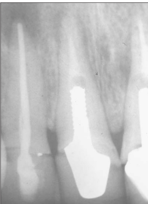
Fig. 8 This complicated case exhibits a number of different endodontic problems, and requires careful treatment planning if success is to be achieved.