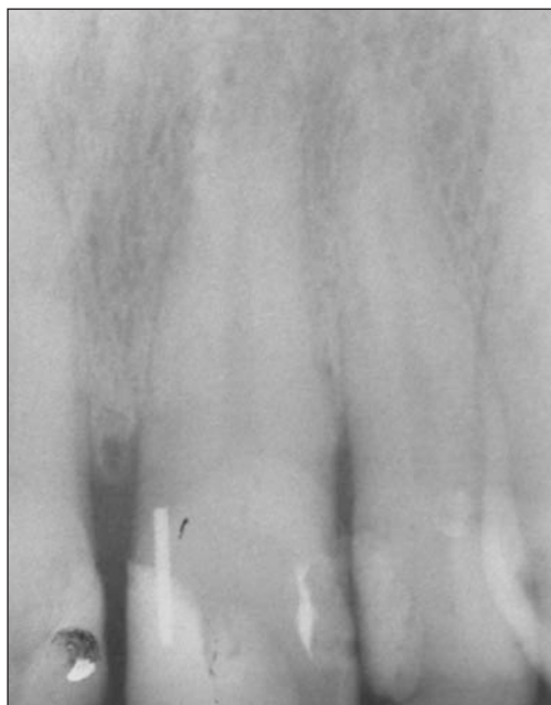
Fig. 9 Tooth UL1 (21) requires a crown, but there is insufficient coronal tissue remaining. One possible treatment plan would be elective endodontic treatment followed by the provision of a post-retained core build-up and crown.

ignored and the treatment deferred until the pulp becomes painful or even necrotic, access through the crown or bridge will be more restricted, and treatment will be significantly more difficult, with a lower prognosis. 5