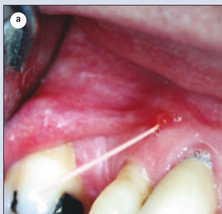
Fig. 5 A gutta-percha point has been threaded into a sinus tract adjacent to a recently root-treated canine (a). The radiograph (b) reveals the source of the infection to be the first premolar.