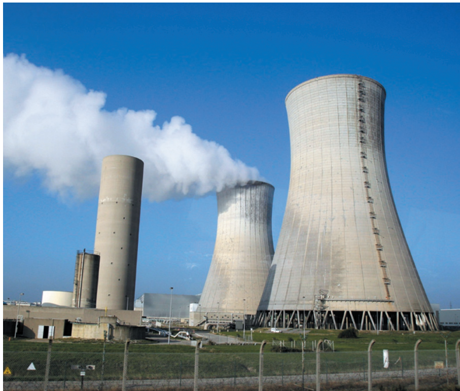
Nuclear plants such as Tricastin will need to build fail-safe systems that operate even after an accident.