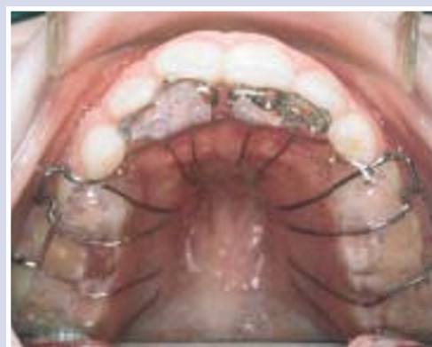
Fig. 7 Upper removable appliance used to correct the anterior cross bite