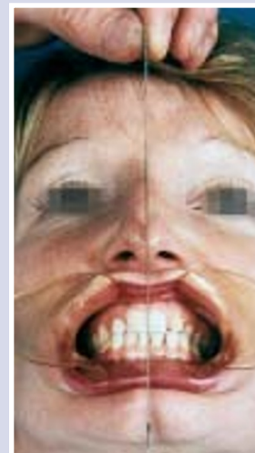
Fig. 4 Measurement of centre line deviation using a ruler placed in the patient's mid line

Finally, the presence of any anterior or posterior cross-bites should be assessed and if there is a cross-bite, the clinician should check to see whether there is any mandibular displacement associated with it. This is important because any displacement will mask the position of the teeth and give a misleading indication of the inter-occlusal relationships. Figure 6 shows a child who has an apparently severe class III incisor relationship. However, he can get his teeth into an edge-to-edge relationship and in this position the occlusion does not appear to be so severe. The amount of proclination of the upper incisors needed to correct the incisor relationship was quite mild and easily accomplished using a removable appliance (Fig. 7 and 8).