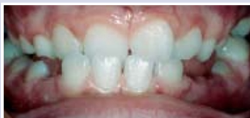
Fig. 6 Class III malocclusion with a displacement anteriorly. The patient can achieve an edge to edge incisor relation in the retruded position of the mandible