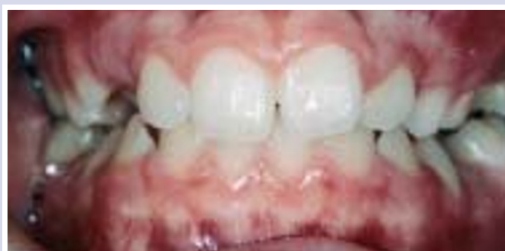
Fig. 8 The corrected incisor position for the patient