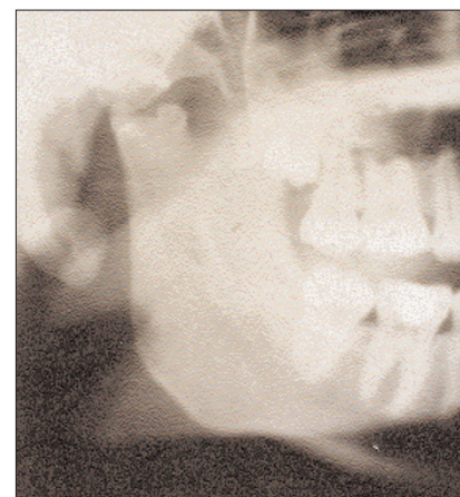
Fig. 2 Right mandibular condyle and ramus