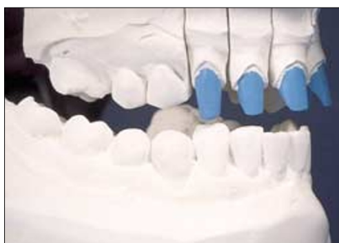
Fig. 13e Using this technique it is easy to see exactly what the crown length and palatal contour should be to provide the same canine guidance as was present in the provisionals