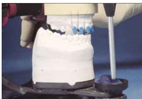
Fig. 13c Custom incisal guidance table is used to guide the upper working model into the same left lateral excursion as was present in the provisional restorations (This would be a right lateral excursion in the patient)