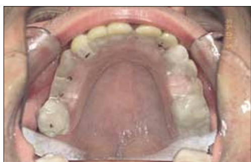
Fig. 12d Mirror view of upper stabilisation splint