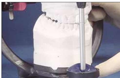
Fig. 13a The models, including provisional crowns on upper anterior teeth, are used to carve a custom incisal guidance table in a slow setting autopolymerising acrylic