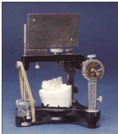
Fig. 2 The flag is attached to the articulator and the incisal pin is set before the upper model is removed