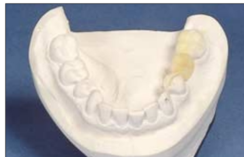
Fig. 10b Lower model after wax up to idealised occlusal planes