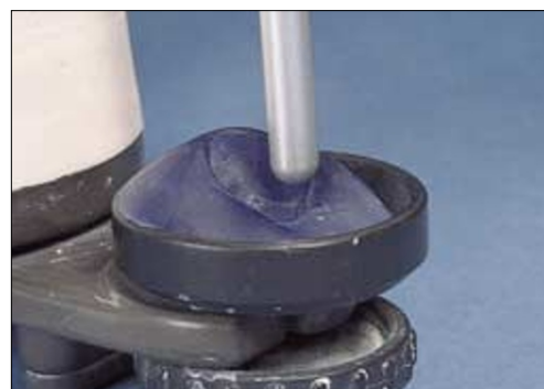
Fig. 13f Custom incisal guidance table determining the length of right canine definitive crown

The planning and design phase of the process is completed when the clinician has a set of articulated models and is confident that they are an accurate representation of the end point of the treatment plan