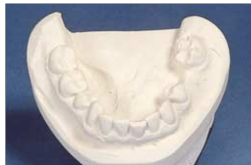
Fig. 10a Pre-operative lower model

Equilibration will already have been performed on the models in the design phase; so the end point and adjustments required to