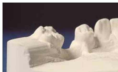
Fig. 11a Pre-operative lower model, illustrating lingual and mesial tilting of distal abutment of proposed bridge