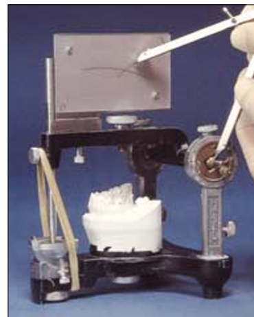
Fig. 4 The canine arc is bisected by an arc using the articulator hinge as its centre. This intersection is the centre of a possible occlusal plane (sphere)