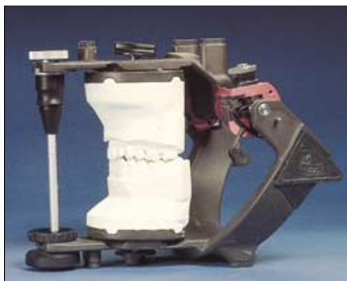
Fig. 1a Pre-operative view before proposed crown preparation of LL4,5,6,7 (34,35,36,37)

The reference points of the pre-existing occlusion may be lost with the first sweeps of the air rotor