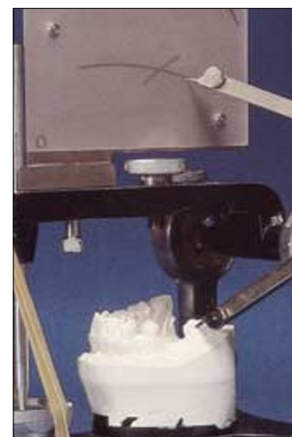
Fig. 6b This occlusal plane would be too traumatic to the distal abutment of the proposed bridge