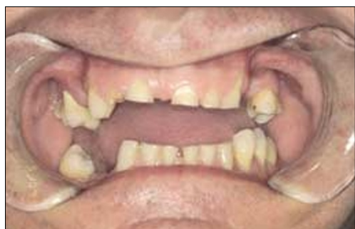
Fig. 12b Patient's dentition exhibiting significant tooth surface loss