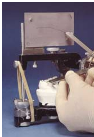
Fig. 3 An arc is drawn on the flag at a set radius using the tip of the lower canine as its centre (Canine Arc)