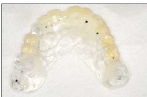
Fig. 12c Upper stabilisation splint with labial veneers to fit over unprepared upper anteriors