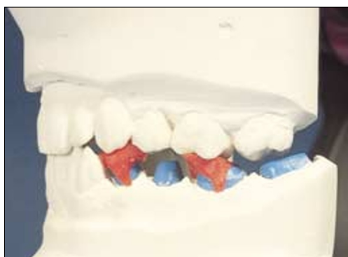
Fig. 1c All teeth are now prepared, but bites against LL4 and 6 ensure models are mounted to pre-operative registration (conformative approach)