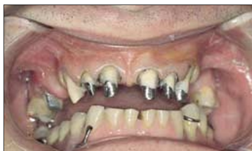
Fig. 12g Definitive lower restoration by partial denture and crown preparations of upper anterior teeth, at the prescribed vertical dimension