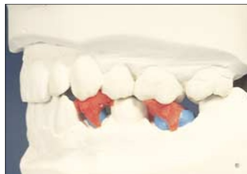
Fig. 1b LL4 (34), LL6 (36) are prepared and Duralay 'bites' taken on these teeth using occlusal contacts on LL5 (35) and LL7 (37) to ensure the 'conformative approach'

primary need for restoration of their teeth but also who have a TMD. These patient, in the authors' opinion, require the closest adherence to the principles of the re-organised approach.