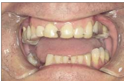
Fig. 12e Anterior view of upper stabilisation splint. Note the provision of median diastema