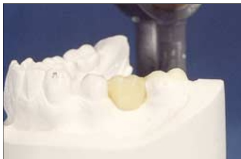
Fig. 8 Morphology is carved into the wax, to represent the final abutments and pontic of the proposed bridge to a planned occlusion

Is equilibrium possible? Practice on plaster before making irreversible changes in the mouth