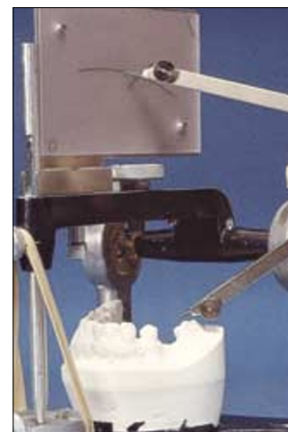
Fig. 6a This occlusal plane would be impossible against the opposing molar

Step 6. Use a knife attached to the geometric dividers to trim the wax down to this plane. This will give the position of the cuspal tips of the teeth to be restored, on both the curves of Wilson and Spey (Fig. 7a-c).