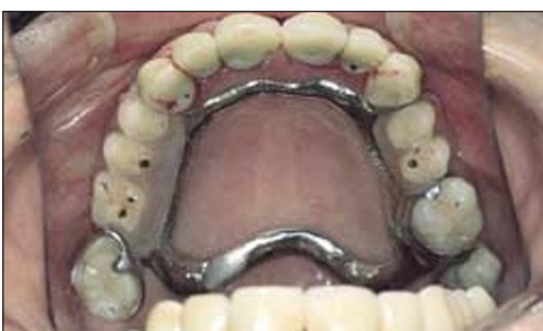
Fig. 12h Mirror view of upper definitive restoration by partial denture and anterior crowns as developed in the 'provisional' phase