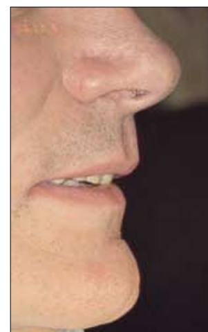
Fig. 12f Provisional restoration vertical dimension and labial support by the upper stabilisation splint. Compare with Fig. 12a