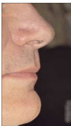
Fig. 12i Restoration of vertical dimension and labial support

It may not be possible in every case to provide all of the features of an ideal occlusion. It is inevitable that dentists as restorers and replacers of teeth, sometimes change occlusions. These guidelines are listed to emphasise the point that we should plan to make the changed occlusion as