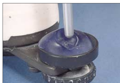
Fig. 13d Close up of custom incisal guidance table, guiding upper model into a left lateral excursion