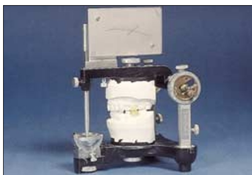
Fig. 9 Minor occlusal adjustment is necessary to the teeth opposing the abutment teeth, whereas the crown on the overrupted tooth opposing the gap ( in this case) will need to be replaced

Step 7. Carve morphology into the wax to create the waxed up teeth (Fig. 8). (How do you carve an elephant out of a block of marble? Knock off all the bits that don't look like an elephant.)