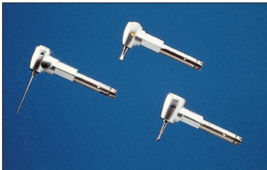
Above: KaVo endodontic heads offer dentists a choice of features. Lux (illuminated) and non-Lux versions of each head are available as hand instruments or in engine powered versions. All KaVo heads are fully autoclavable.