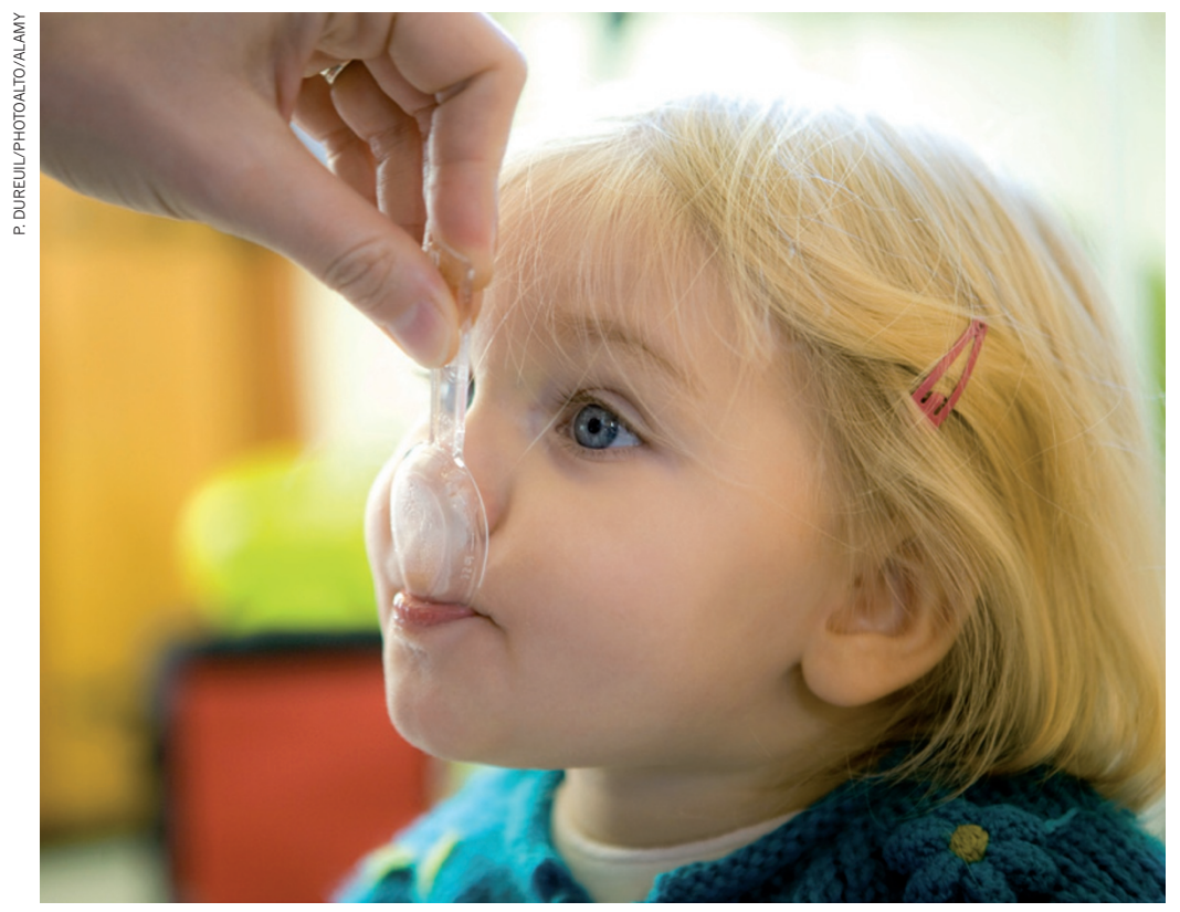
Dosed up: could excessive prescription of antibiotics be hampering children's ability to fight disease?

OBITUARY Jonathan Widom, genomic map-maker, remembered p.400