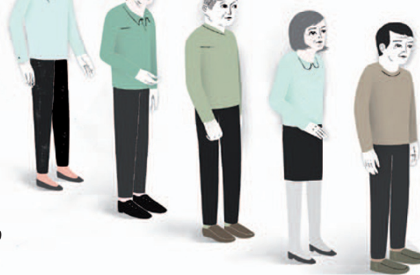
ILLUSTRATION BY GRACIA LAM