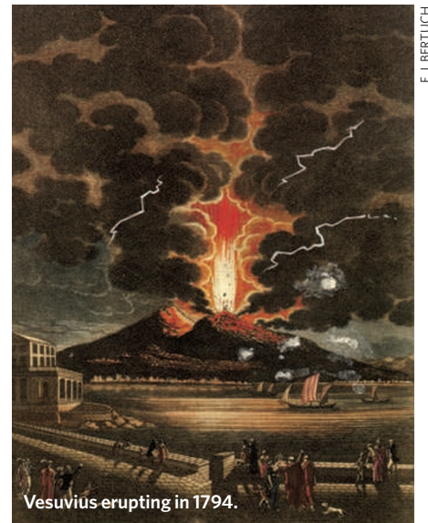
Vesuvius erupting in 1794.

The authors focus on Italian volcanoes, which