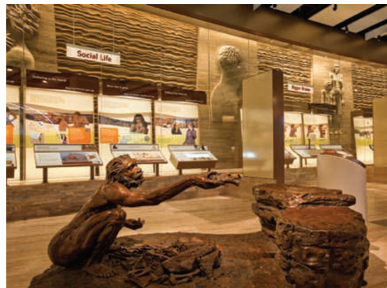
The permanent exhibit casts climate change as the driver of human evolution.

Another display encourages visitors to feel the sloping face of a 2.5-million-year-old Australopithecus africanus skull, balance a pencil on the prominent brow ridges of a 350,000-year-old Homo heidelbergensis skull and compare both with the face of a modern human. People can practise forensic anthropology with the most precious fossil in the collection: 130 bones of the only Neanderthal skeleton housed in the United States. He was a 40-something male, found in Iraq, who had arthritis and probably died from a stab wound to the chest. The most crowded part of the exhibit is the least scientific: a photo booth