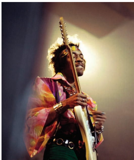
Jimi Hendrix and Johann Bach used similar ornamental trills.

After pages dissecting technicalities — such