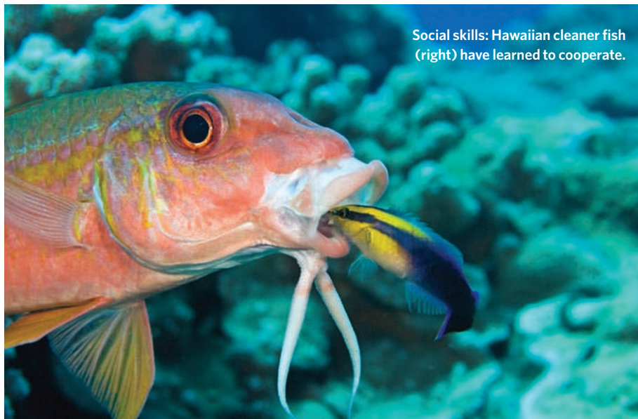
Social skills: Hawaiian cleaner fish (right) have learned to cooperate.

For more on science and music, see www.nature.com/nature/focus/scienceandmusic .