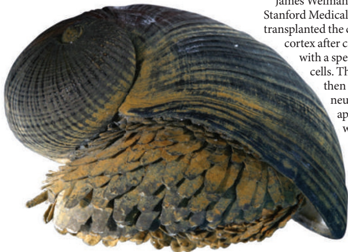
A. WARÉN, SWEDISH MUSEUM OF NATURAL HISTORY, STOCKHOLM

A rigid iron-based outer layer provides a first line of defence against microfractures, whereas a more flexible organic middle layer assists in dissipating energy and arresting cracks. An inner rigid calcified layer provides structural support and resists bending.