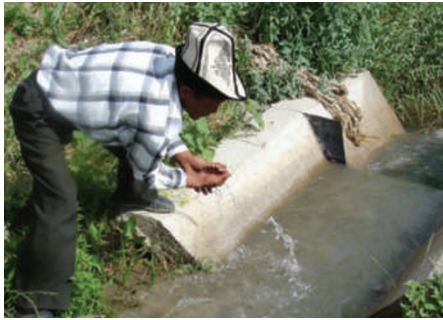
Canals in many Asian regions are in dire need of maintenance.

The report also suggests that governments should support and regulate extraction from groundwater aquifers by individual farmers, rather than condemn the practice. For a longer version of this story, see http://tinyurl.com/news-2009-826