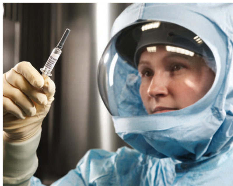
Boosting demand could help vaccine manufacturers keep their facilities open.