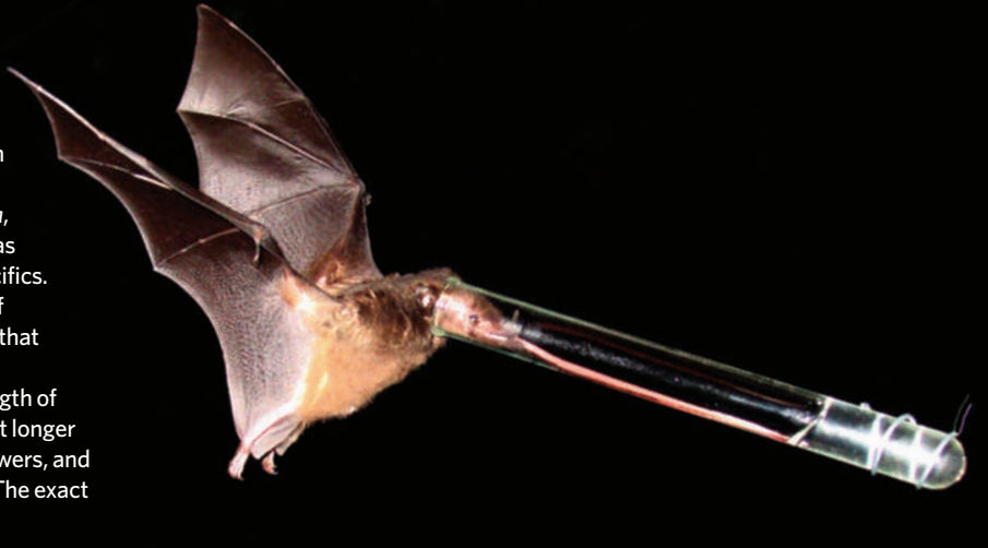
N. MUCHHALA & J.D. THOMSON

The duo experimentally manipulated the length of the flower Centropogon nigricans and found that longer tubes delivered more pollen to bats in male flowers, and took more pollen from bats in female flowers. The exact mechanism, however, remains unknown.