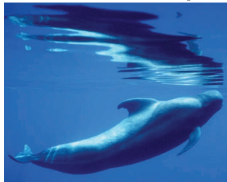
Whales will have to put up with the US navy's training exercises.

In a 5–4 ruling released on 12 November, the court rejected arguments that the restrictions were necessary to protect the animals from becoming harmed or disoriented by the sonar. The concerns are “plainly outweighed by the Navy's need to conduct realistic training exercises to ensure that it is able to neutralize the threat posed