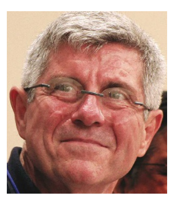
Giovanni Bignami is head of the Italian Space Agency.

The shake-up began in early July when six of seven members of the space agency's governing council resigned to allow the Berlusconi government "the greatest level of freedom" in