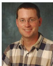
Bert Metz, co-chair of IPCC Working Group III

The scenarios produced by the IPCC assume that very substantial technological advances — leading to greater energy efficiency and reduced carbon dioxide intensity — will happen spontaneously, without extra policy measures (see page 531).