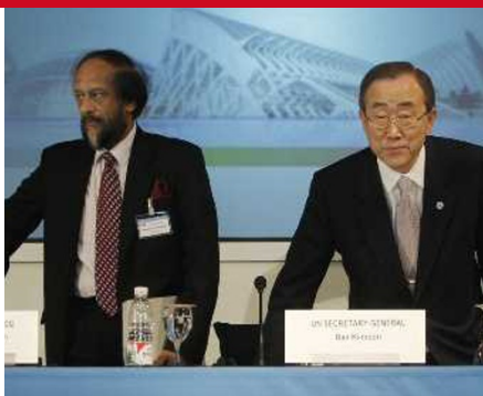
IPCC chairman Rajendra Pachauri (left) and UN secretary-general Ban Ki-moon at the release of the climate body's synthesis report.

The report confirms that it is at least 90% certain that global warming is real