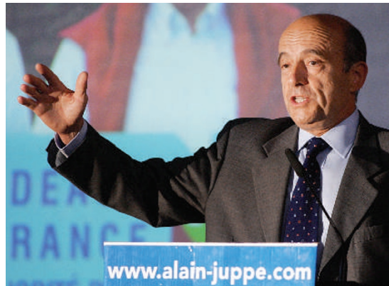
Grand gestures: Alain Juppé has taken the reins at France's new superministry for ecology and sustainable development.

Science and higher education have been granted a full-blown ministry, too, headed by Valérie Pécresse. The move was by no means guaranteed, given that Sarkozy has halved the number of ministers in his government to 15, and that the previous government allotted these sectors only junior status. Bernard Kouchner, co-founder of the medical humanitarian aid group Médecins Sans Frontières and a member of the opposition socialist party, has been appointed foreign minister. And Fillon, a