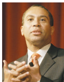
Deval Patrick: planning a boost for biotech.

Massachusetts governor Deval Patrick has proposed a US$1-billion life-sciences initiative intended to sustain the state's prominent biotechnology industry in the face of stagnant federal funding and increasing competition from