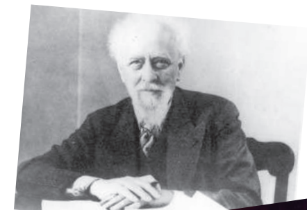
Jean Baptiste Perrin (above) provided a new understanding of Robert Brown's notion of random motion.