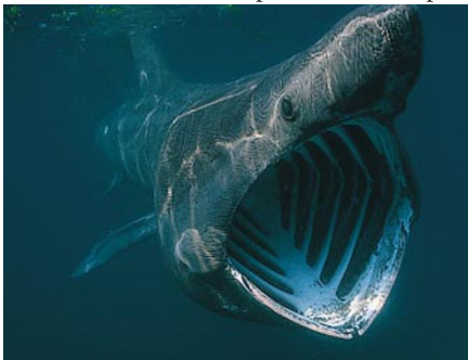
Figure 1 Feeding time. The basking shark ( Cetorhinus maximus ) feeds on plankton, which it filters from sea water using bristle-like projections on the arches of its gills. In winter the concentration of plankton is reduced below a threshold level, and sharks were thought to escape starvation by hibernating or migrating. But a study by Sims 3 indicates that the threshold of plankton needed by the sharks is much lower than previously estimated, and that the sharks do not need to hibernate or migrate in winter.

The study by Liu et al. 3 sheds light on two issues: the function of a central brain structure on an elementary form of cognition, and the role of context in learning. Mushroom bodies are prominent paired structures in the insect brain (Fig. 1), and are considered