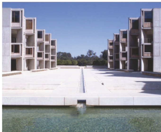
An architectural landmark, the Salk Institute is set to grow.