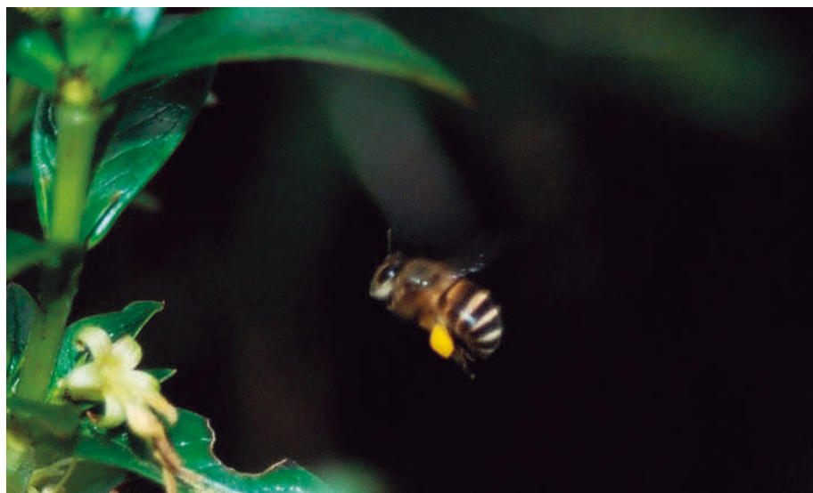
Never mind the buzz about Apis mellifera — A. nuluensis is one of eight other honeybee species in Asia.