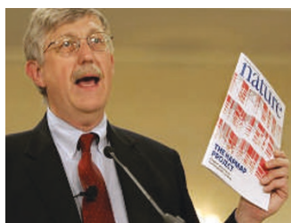
Francis Collins is a devout Christian.

"The moral law is a signpost to a God who cares about us as individuals," Collins says. "God used a mechanism of evolution to create human beings with whom he could have that kind of fellowship."