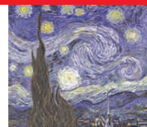
VAN GOGH PAINTED PERFECT TURBULENCE The disturbed artist intuited the deep forms of fluid flow. www.nature.com/news