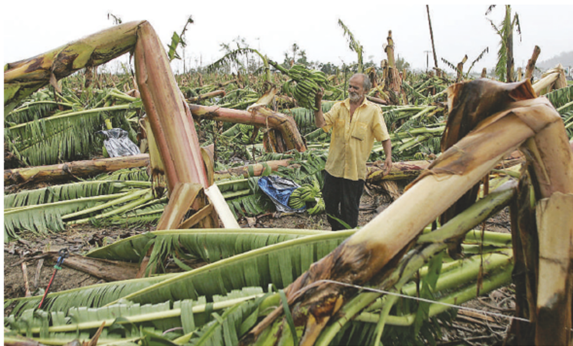
Entire plantations were wiped out when Cyclone Larry (left) struck land earlier this year.

The picture gets even bleaker in the world's other ocean basins. In a recent informal study, Landsea looked through satellite images of storms in the northern Indian Ocean. From these pictures, he estimated that the storms should have been rated as category 4 or 5; they were recorded as being of lower intensities at the time. Landsea says that if these storms are missing from the records, how is it possible to conclude that hurricane intensities are increasing because of global warming? They could be,