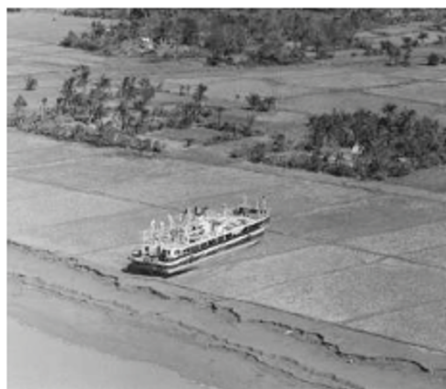
Destructive force: a cyclone that hit what is now Bangladesh in 1970 killed up to half a million people.