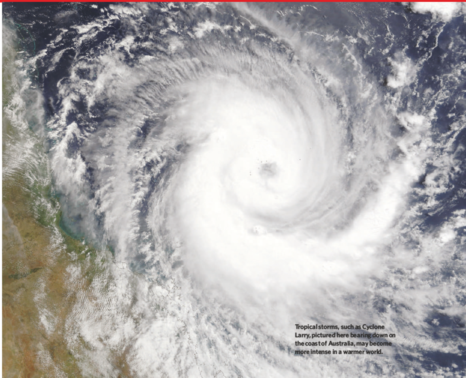
Tropical storms, such as Cyclone Larry, pictured here bearing down on the coast of Australia, may become more intense in a warmer world.