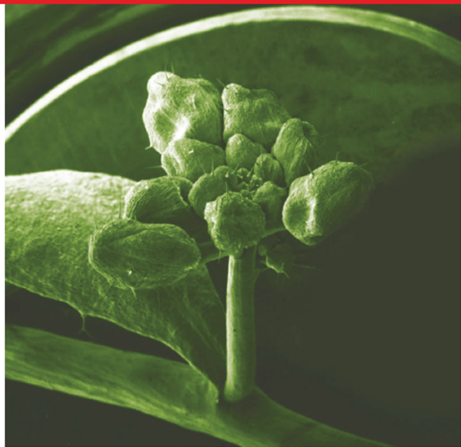
Back-up copies: mutant DNA in the cress plant may be 'corrected' by inherited RNA.

plant could perform such a feat. One idea is that they carry a back-up copy of their grandparents' genetic information encoded in RNA that is passed into seeds along with the regular DNA and is then used as a template to 'correct' certain genes. Conceivably, Pruitt says, some of the mystery non-coding transcripts could be responsible. "I think there's something being inherited outside what we think of as the conventional DNA genome."