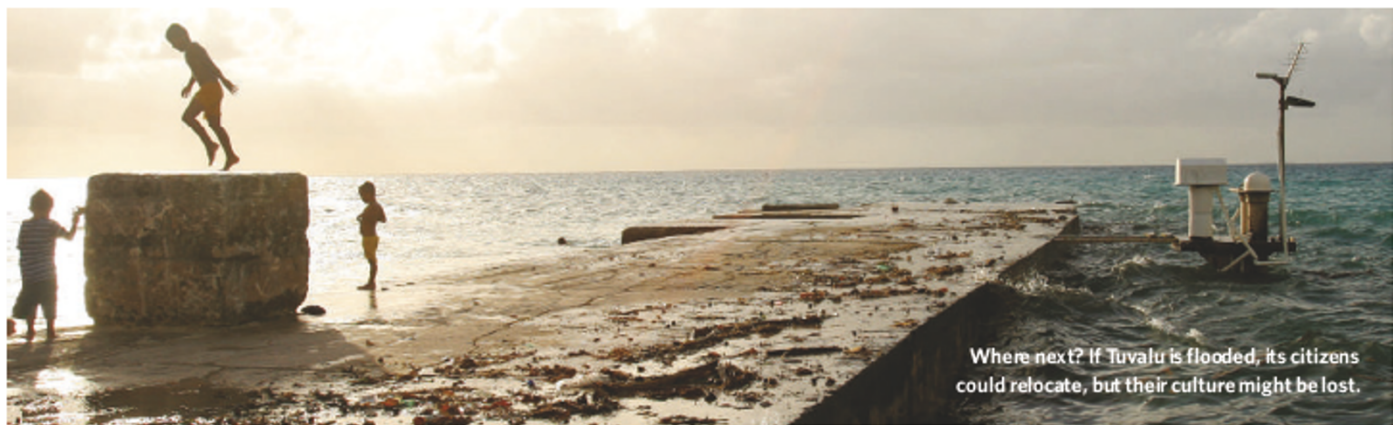
Where next? If Tuvalu is flooded, its citizens could relocate, but their culture might be lost.

tyres it is easy to get from one end to the other in a morning. The ride is comfortable, because the roads were resurfaced with a windfall from the sale of Tuvalu's appealing Internet country code, '.tv', although the speeding motorcycles and cars no longer have to slow for potholes.