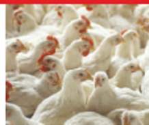
BIRD FLU IN FOCUS Find all of Nature's coverage on avian flu in one place. www.nature.com/news/infocus/birdflu.html