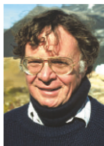
Among the first to see the effect of the global conveyor on climate was Wallace Broecker.

“For the first time we’ll be able to observe the ocean ‘weather’ in all its complexity.” — Gavin Schmidt