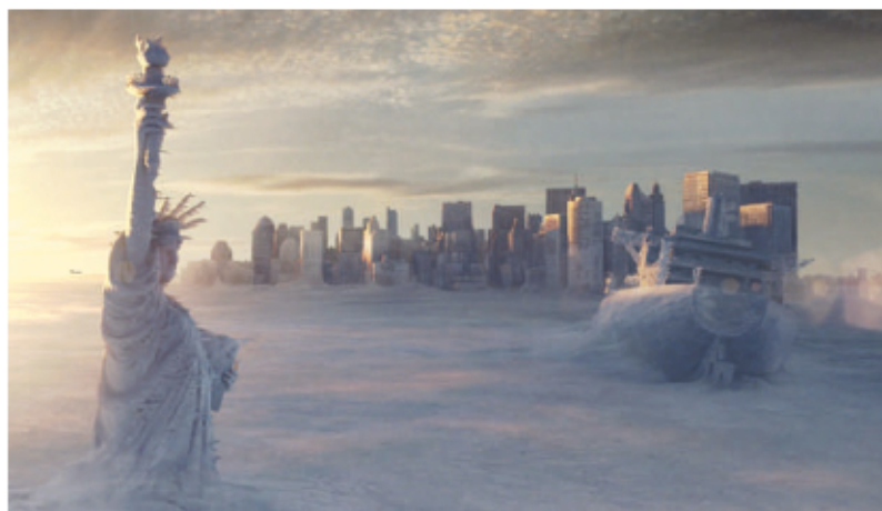
The shutdown of the Atlantic currents plunged New York into an ice age in The Day After Tomorrow .

It is hard to evaluate the amplifying role of sea ice very precisely. Most coupled ocean-atmosphere models include a sea-ice component, but the representation is crude and leads to an unrealistic simulation of sea-ice distributions. If this feedback is as important as Broecker thinks, then the effects of a thermohaline circulation shutdown in a warmed world may be very different from those seen during the ice ages and their immediate aftermath. Today, satellite images show sea-ice cover at a