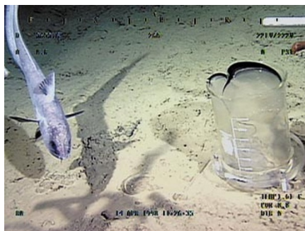
Deep thought: the effects of liquefied carbon dioxide on the ocean environment are already being studied by the University of Hawaii.

With terrestrial sequestration, carbon dioxide emissions would be pumped into geological formations or old oil wells, reduced by farming techniques (such as eliminating deep ploughing), or offset by forestry procedures such as planting more